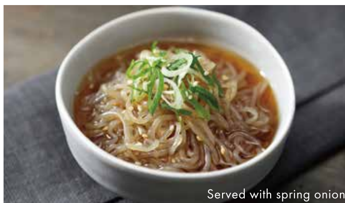
Served with spring onion